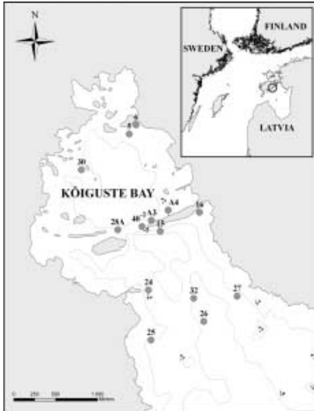
Figure 1. The study area. The circle indicates the location of the Gulf of Riga and points indicate the locations of the sampling sites with station numbers in Kõiguste Bay (northern Gulf of Riga). Broken lines denote depth contours in metres

This study was conducted in the shallow semi-enclosed Kõiguste Bay, Gulf of Riga, northern Baltic Sea ( 58^{\circ}22.1'N 22^{\circ}58.7'E ). The prevailing sediment type in the bay is sandy clay mixed with pebbles or gravel. The bay varies in depth between 1 m and 7 m and in salinity from 4.5 to 5.5 PSU. The proliferation of ephemeral macroalgae and the appearance of thin drifting algal mats have been reported from the area in recent years, when the principal filamentous algae species in these mats were Cladophora glomerata and Pilayella littoralis (Lauringson & Kotta 2006, Kotta et al. 2008a).